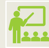
Webinars and masterclass courses (one full day or one full weekend)