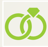
Marital advice and counselling, workshops