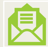
JKN Fatawa sisters telegram group and a Q&A group for the brothers