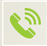
One-to-one discussion: phone or in person (appointment booking required).